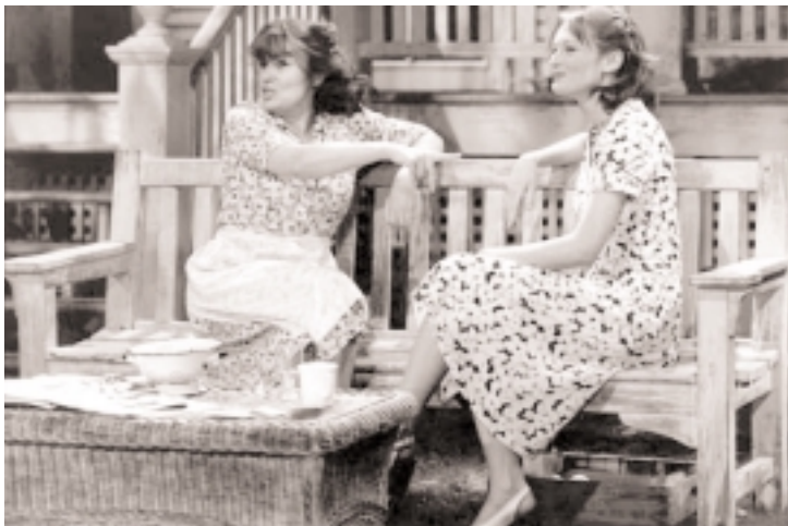
Julie Walters Catherine McCormack

character whose idealism was the source of cruelty. This becomes a minor but important theme in All My Sons , never fully developed but a disturbing presence. More significantly still, he learned from Ibsen the importance of the past which exerts its pressure on the present. One of his central concerns, he has said, is how the chickens come home to roost.